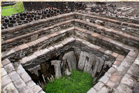
Interior of the Altar V

This is a small room with stairways on all sides located in the southwest corner of The Palace. It may have been dedicated to Tláloc.